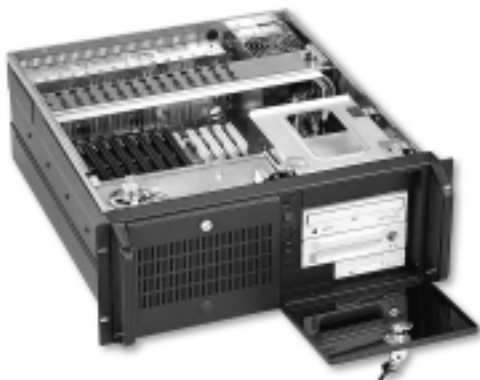
Four front accessible drives